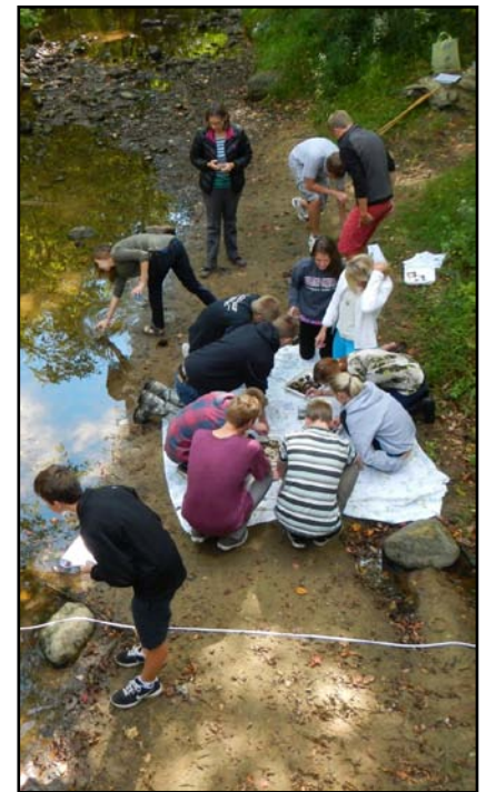
Holland Christian High School Environmental Science students picking through the collection from the North Branch at Van Raalte Farm Park - Fall 2013