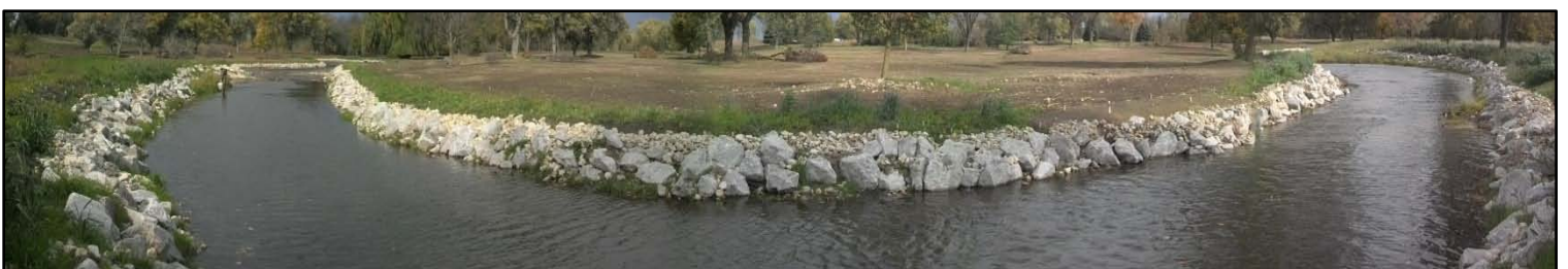
Sampling event on Noordeloos Creek at the Macatawa Greenspace- Fall 2012