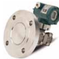
Remote Seals for Pressure Transmitters