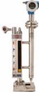
Bridle Radar Transmitter