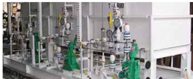
Chemical Injection Skid