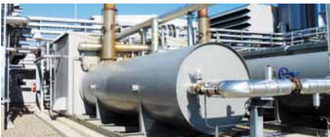
Indirect Water Bath Heater