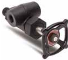
Gauge Valve 20 Series