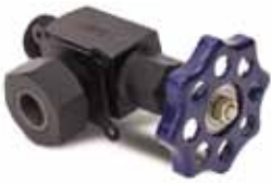
Gauge Valve 10 Series