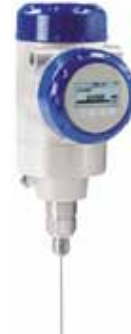
Guided Wave Radar