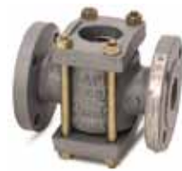
Sight Flow Indicator