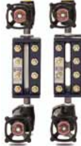
Armoured Sight Glass