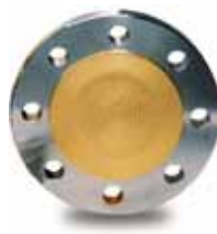
Gold Coated Seals