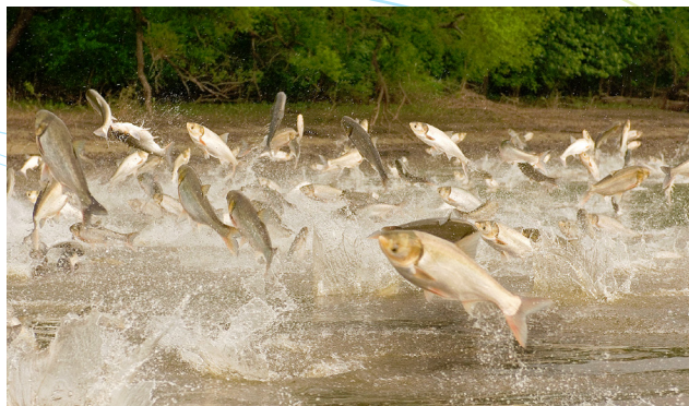
Silver carp , shown here, often feed in schools at the surface and can jump up to 10 feet out of the water when disturbed by boats.

Separation is needed to prevent the movement of Asian carp and other AIS between the Great Lakes and Mississippi River basins in the Chicago-area waterways. Asian carp, in particular, are an imminent threat; in 2010 a bighead carp was collected from Lake Calumet, just five miles from